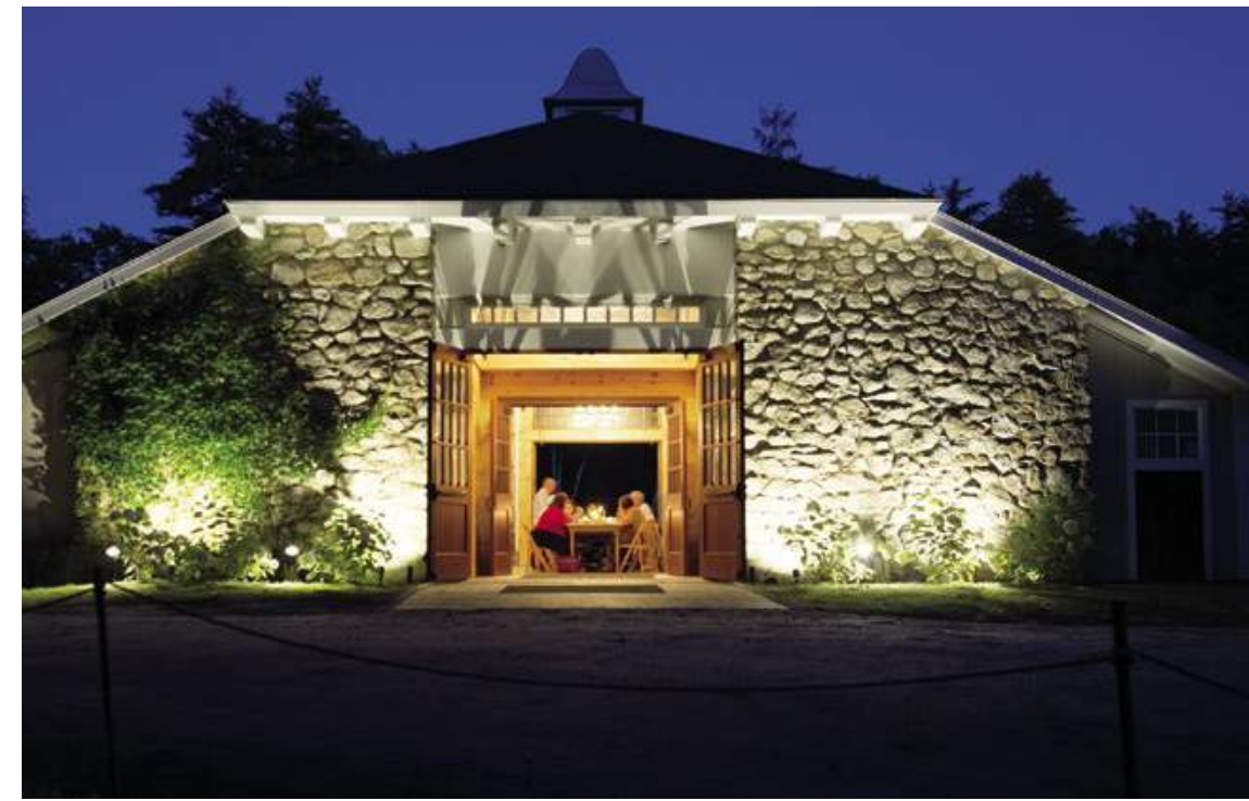
As part of the College's agritourism initiative, the Stone Barn hosted several farm-to-table dinners and dozens of community and private events this season. For more information: www.stonebarnmaine.com.